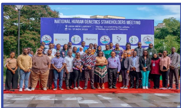
Participants of the THGO 2 nd Annual General Meeting in a group photo (17 th November, 2023, University of Dar es Salaam, Tanzania).